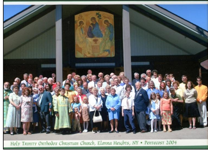
Holy Trinity Orthodox Christian Church, Elmira Heights, NY • Pentecost 2004